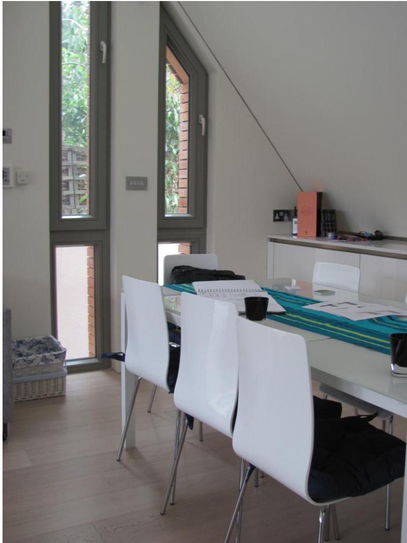
The kitchen dining space with north-west facing windows for daylighting.