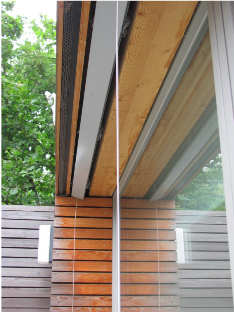
When not in use the blinds are concealed neatly.