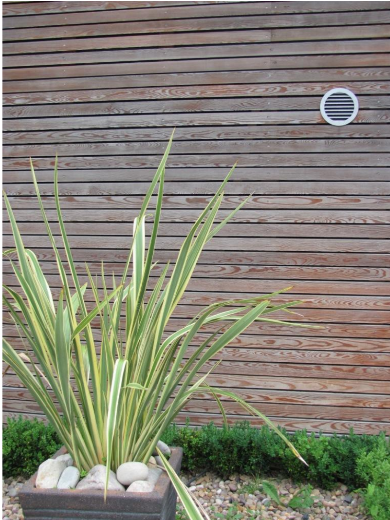
The bike shed wall to the front of the house with the extract for the MVHR unit.