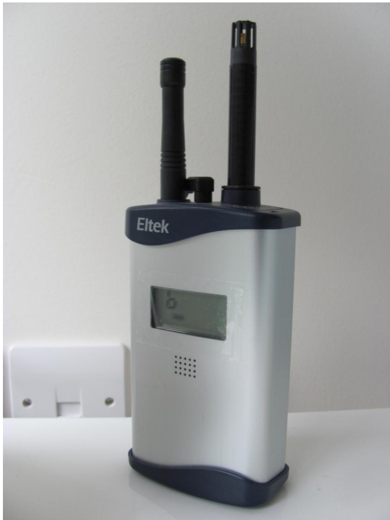
One of the Eltek dataloggers located within the master bedroom.