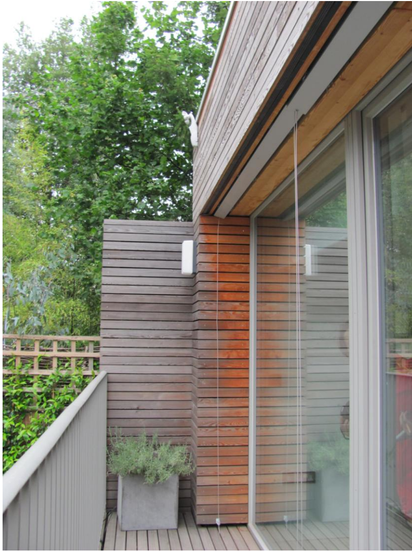
The external first floor terrace to the front of the property.