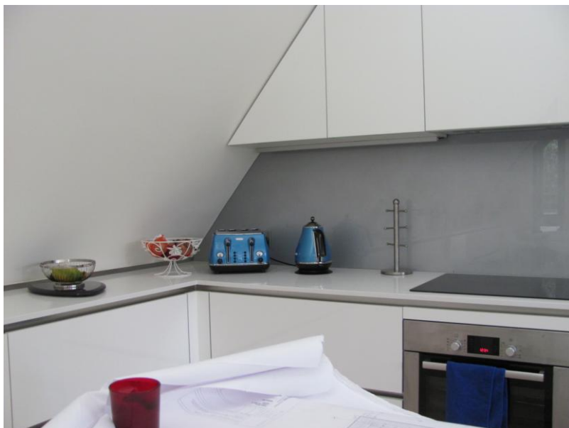
The kitchen space.