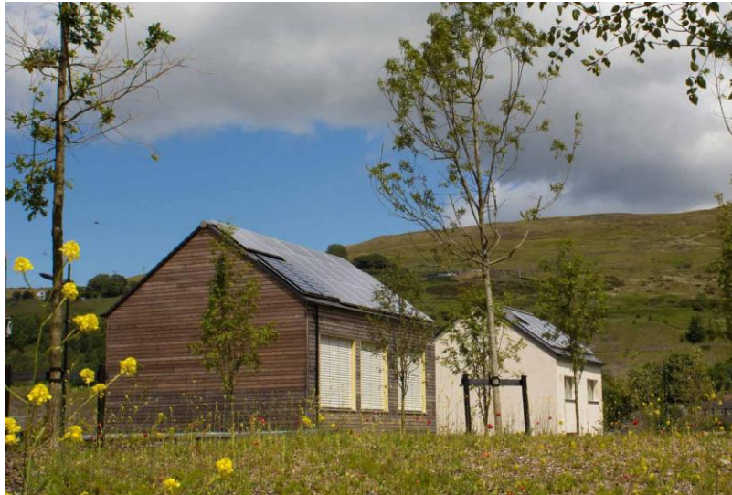
The two Ebbw Vale houses side by side.