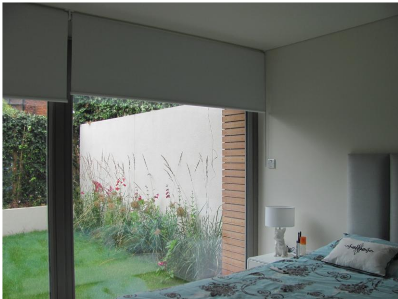
The property's two bedrooms are located on the ground floor. The master bedroom looks out onto the small garden to the front.