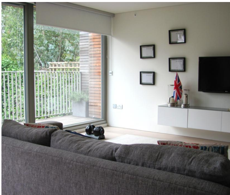
Upstairs open plan living space.