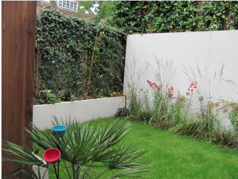
Ivy screening provides privacy. Rainwater is collected and stored in a tank below the lawn.