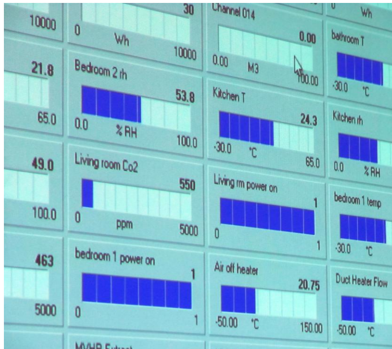
The real time display of how energy is being used within the house.

The monitoring systems are being provided by Elteck , who were able to give us a live demonstration of how the system worked. The system provides a real time display of the many elements being monitored within the house. The readings and data can be accessed remotely via the internet, and any of those involved in the design, construction and research of the building can log on using a unique code. All the data is easily readable and can be downloaded periodically.