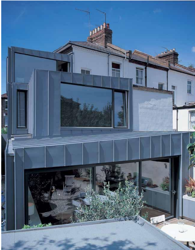
The Focus House

From the Focus House he went on to speak about their projects in Windsor; Smoothfield Farm. This was the first building the practice designed using PHPP, but it still did not gain passivhaus certification.