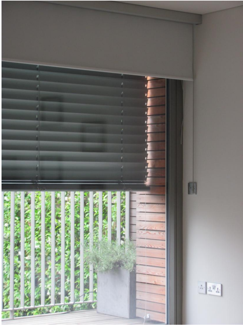
External blinds work automatically on a solar control to provide shading and prevent overheating.